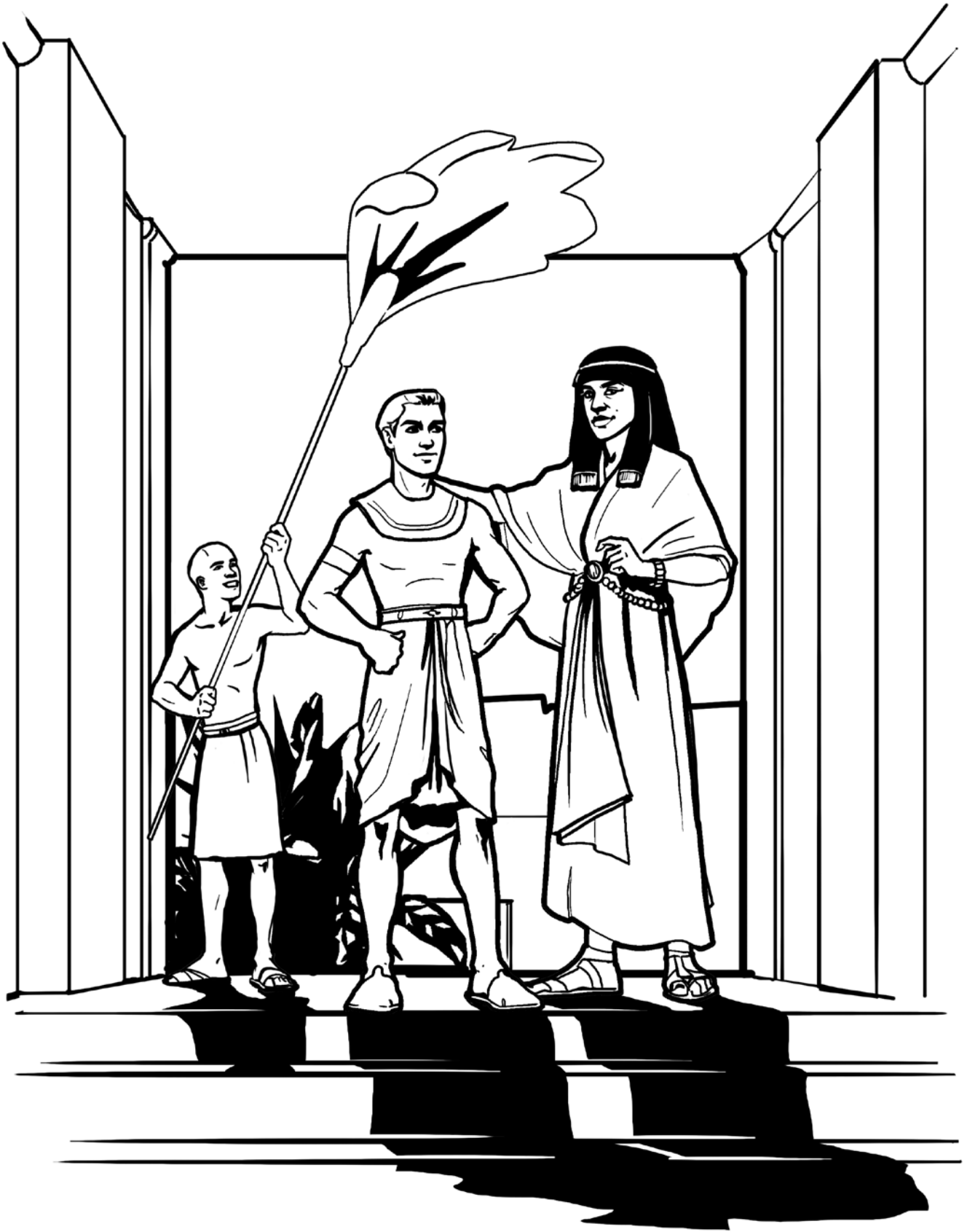
Moses grows up as a prince in Egypt.