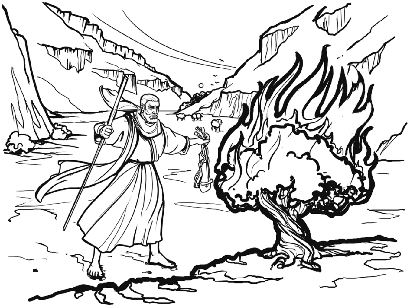
Moses stands before the burning bush.

Moses tried to give excuses why he couldn't complete such a mission.