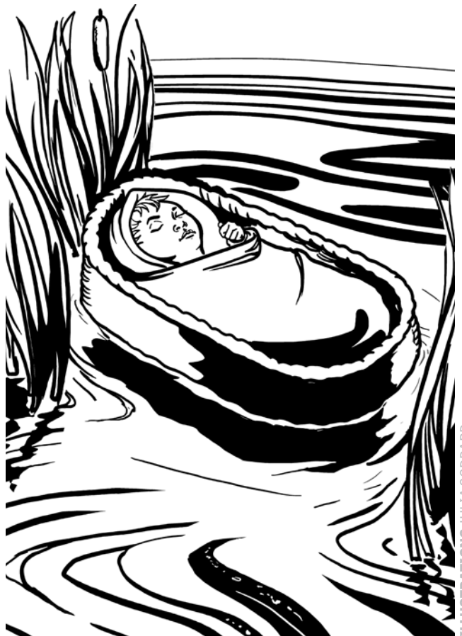
The baby Moses floats in a basket.

Moses was stunned. Would the Israelites believe he had been sent by God? And even if they did, how could he make the pharaoh release them?