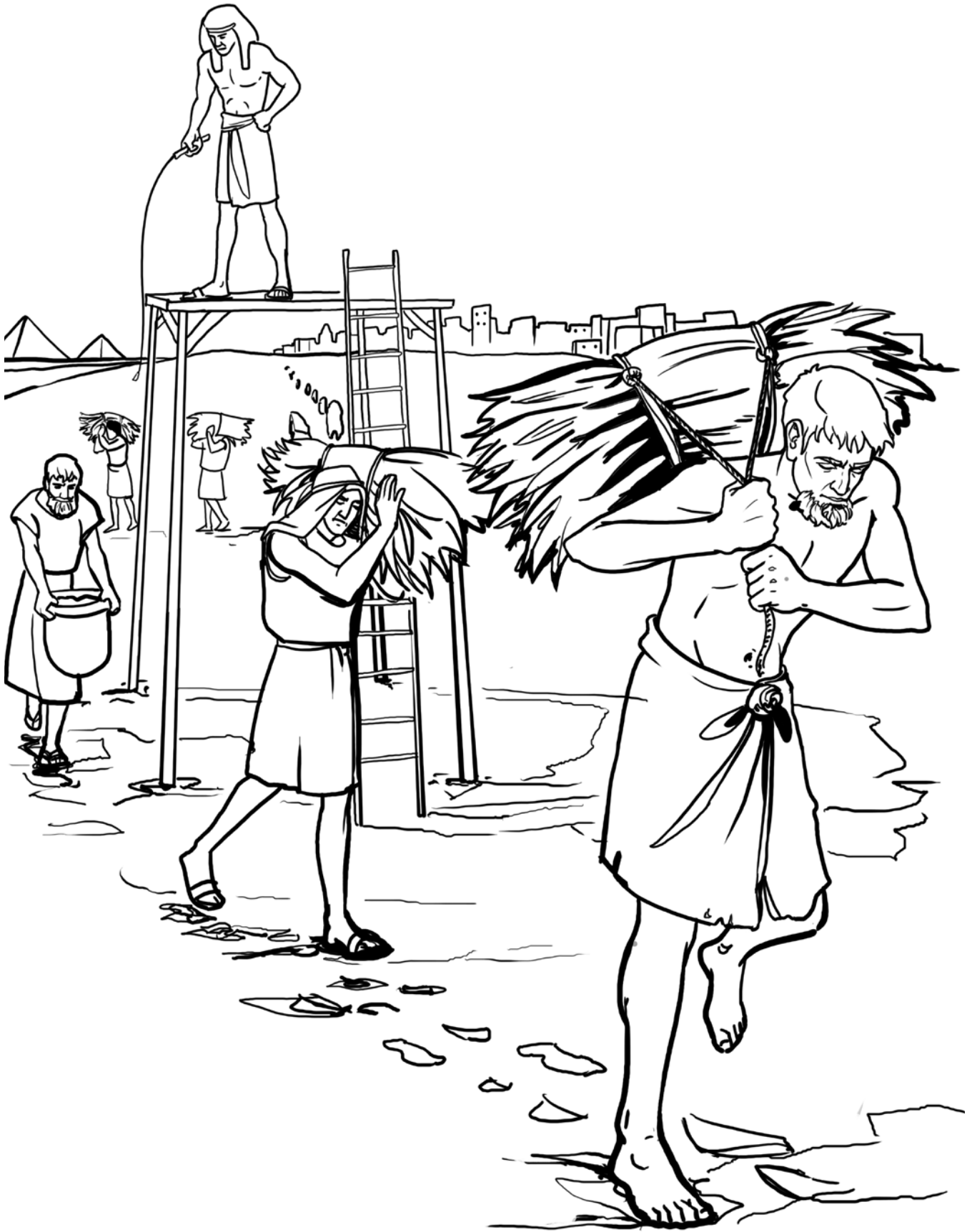
The Israelites endure heavy labor in slavery.