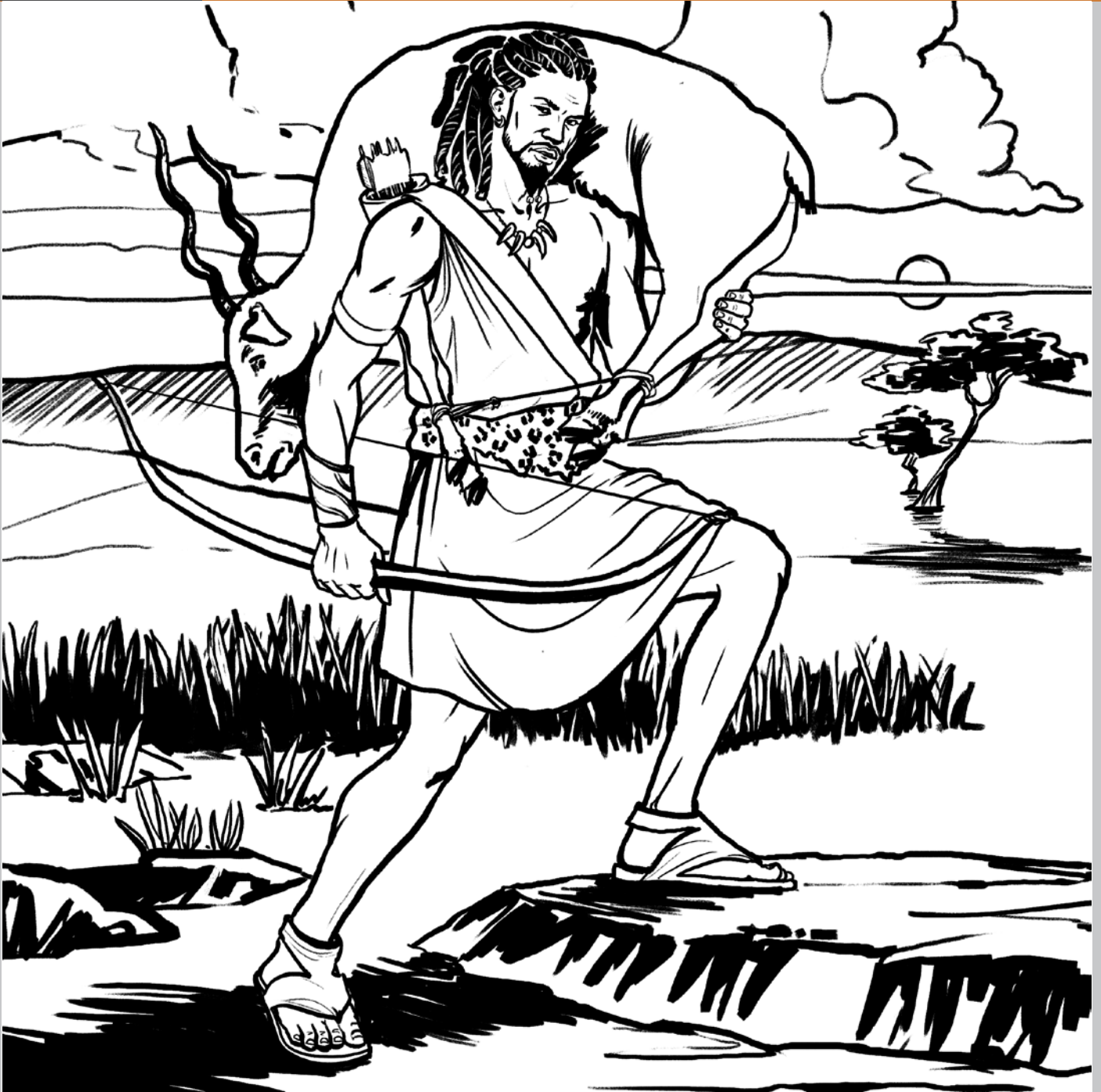
The Tower of Babel