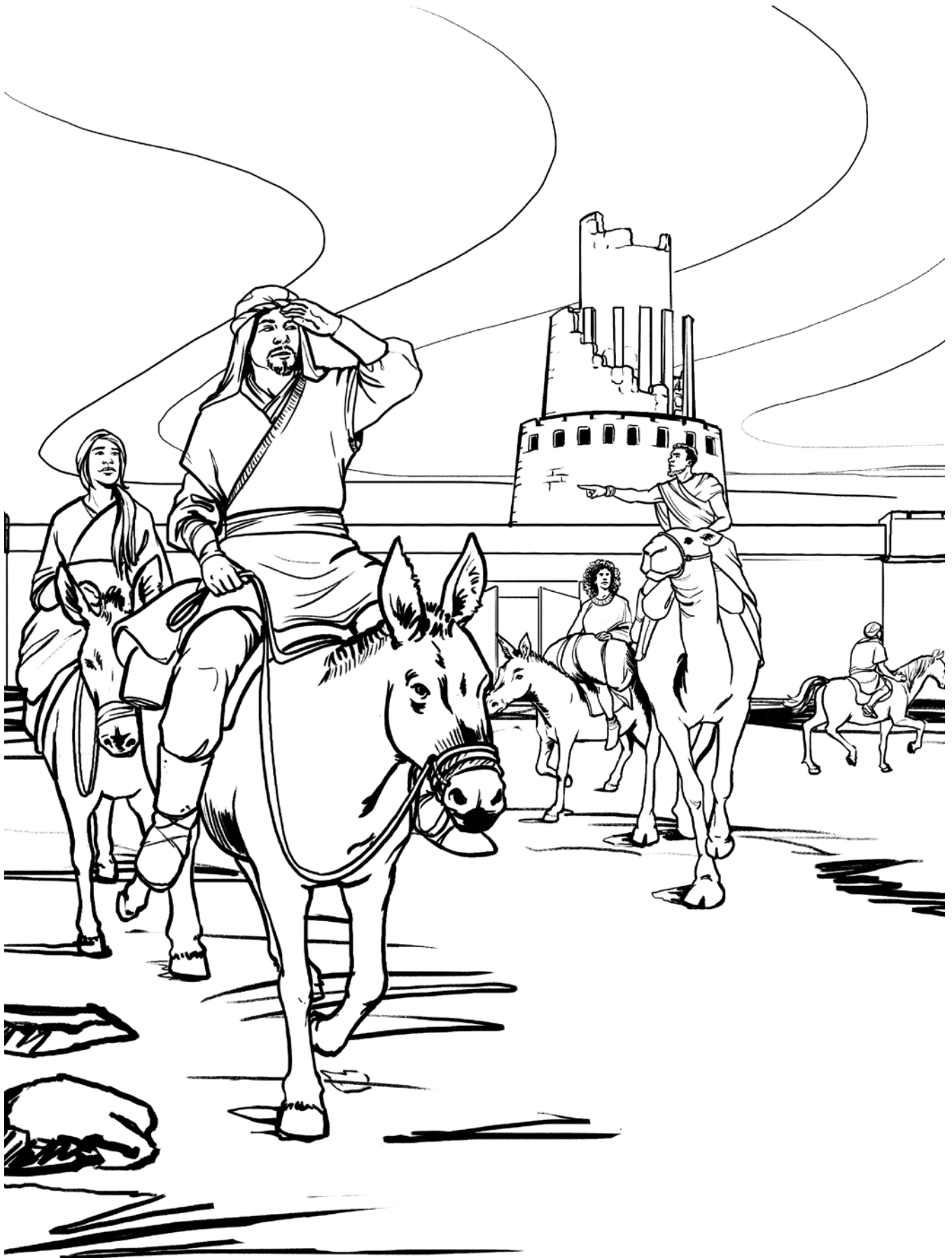
People scatter after God confuses the languages.