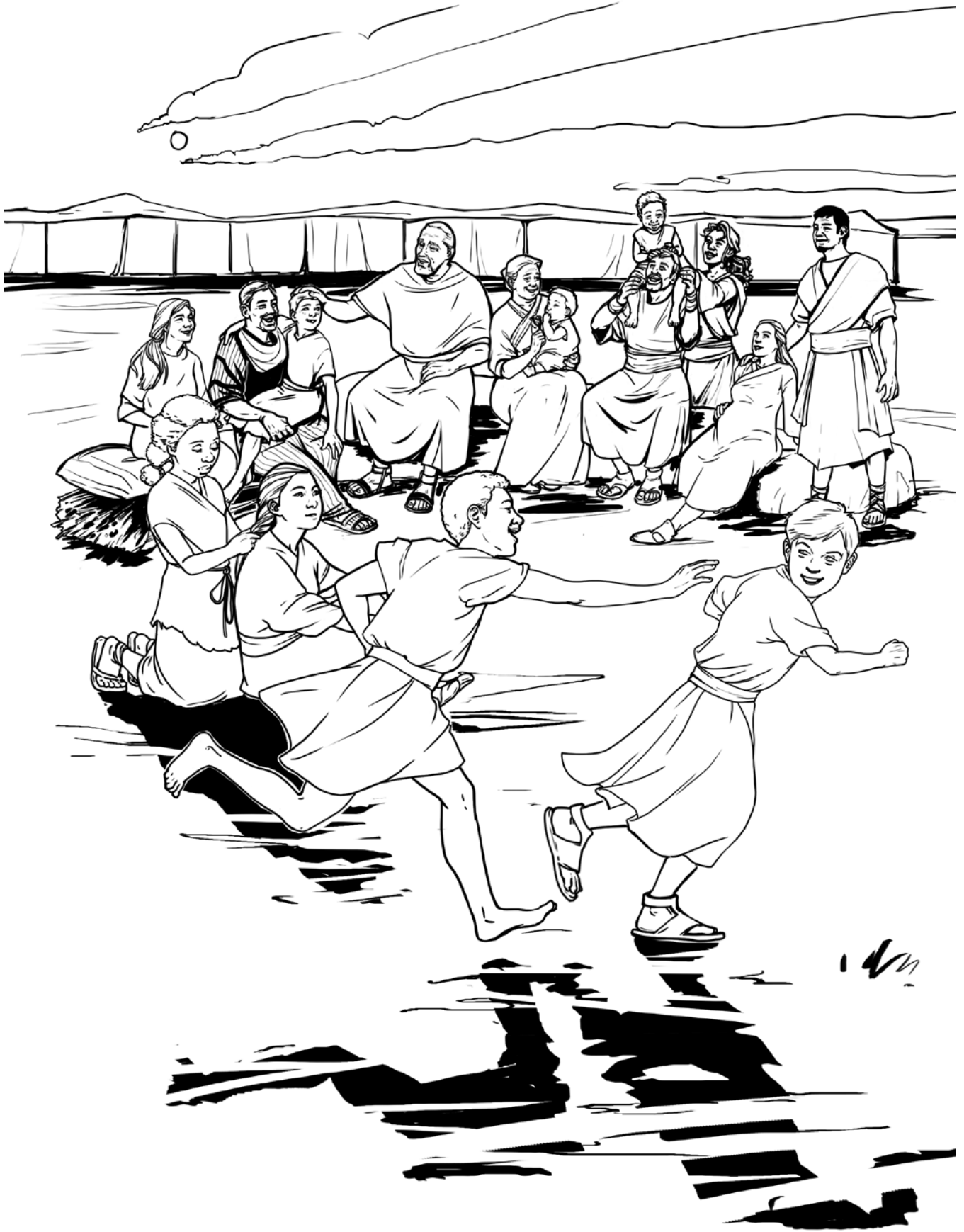
Noah teaches his sons and grandchildren.