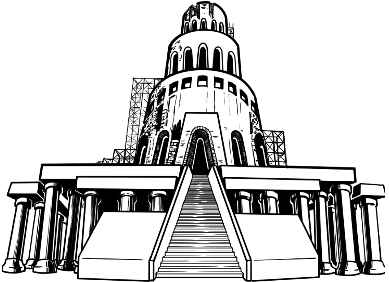
The tower of Babel